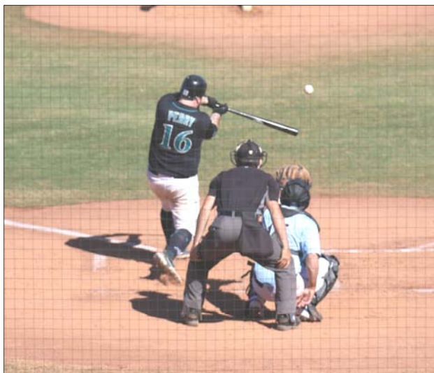
35+ Cactus Seattle Ravens batter, Ben Shively singles to right field during this at bat at Tempe Diablo Stadium